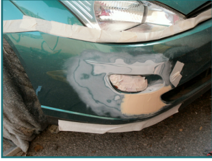
Worse than we thought...

£10 off single repairs and 25% off multiple repairs during August when you mention the Beach Hut!