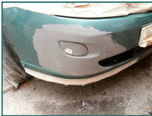
Ready to re-spray