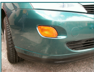
As Good As New!